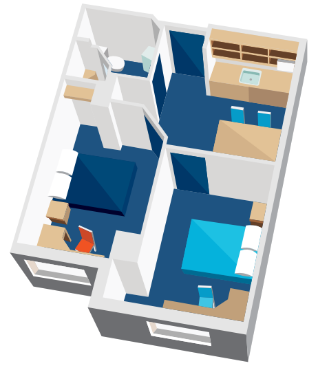
*This rendering is only an approximation of your living space in residence.

You don't need to wait for your program acceptance.